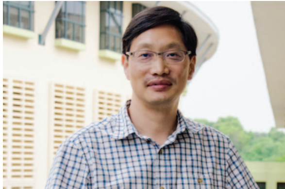
David wants to help students develop the ability to transfer between two problems.

David studied the diffusion of innovations in schools, and strived to show school leaders how new pedagogical innovations could spread in a school—not just through a top-down approach, but by integrating a bottom-up approach as well.